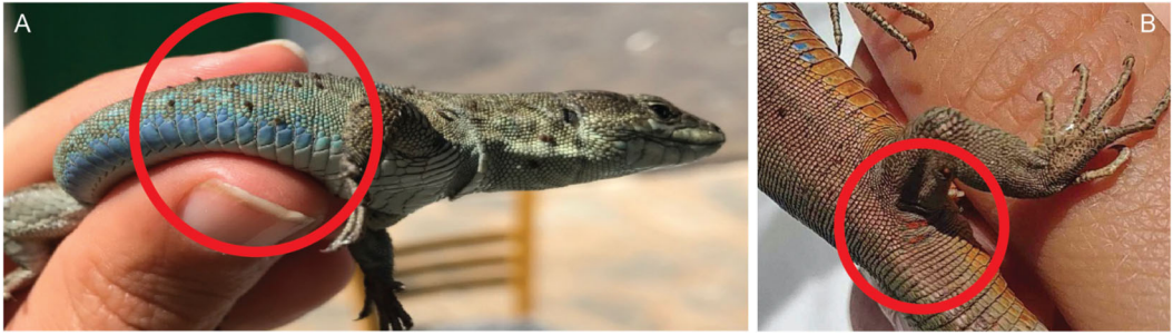
Figure 1. Tick (A) and mite (B) ectoparasites parasitizing P. erhardii . In general, ticks are found dorsally and laterally on the anterior of the lizard. Mites lodge themselves in between scales and usually congregate on the posterior of the body behind the legs and on the tail of the lizard.

acanthothamnos , Corydothymus capitatus ). Vegetation surveys were performed by the same individual to maintain consistency of estimates and to eliminate observer bias.